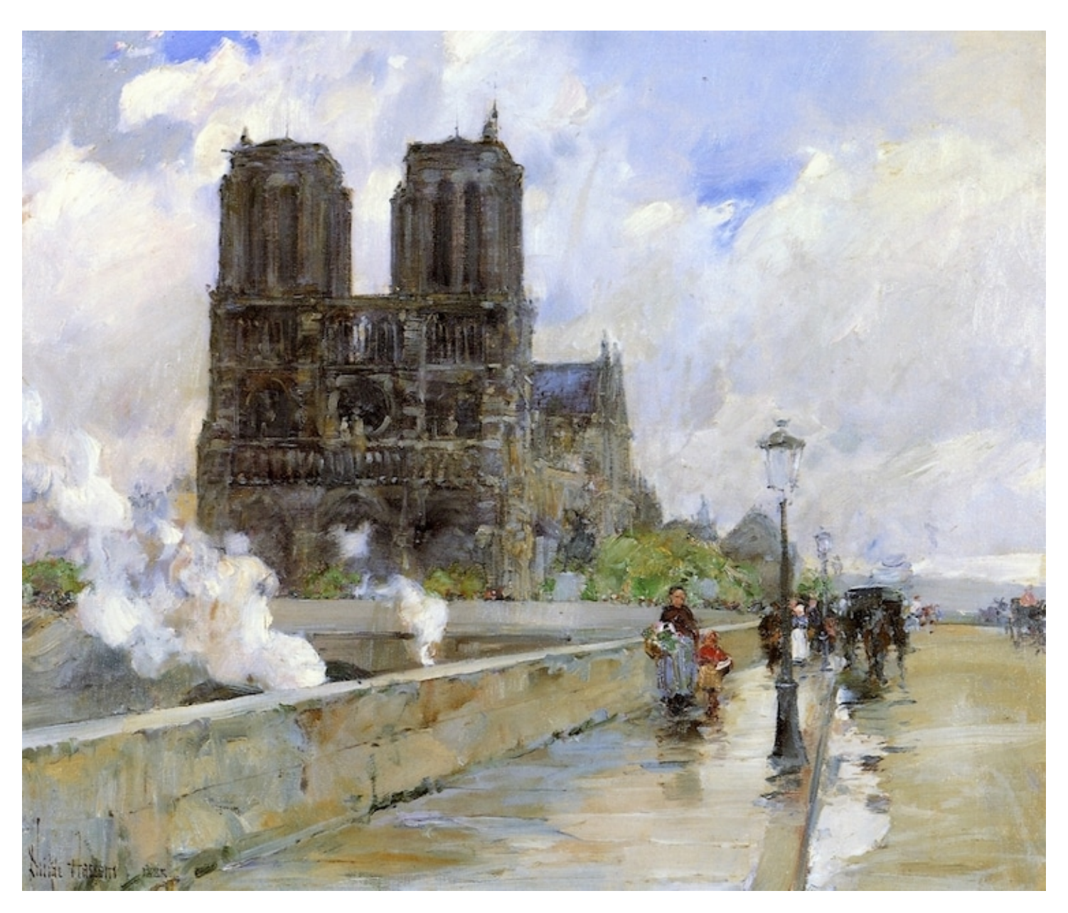
Childe Hassam, "Notre Dame Cathedral, Paris," 1888