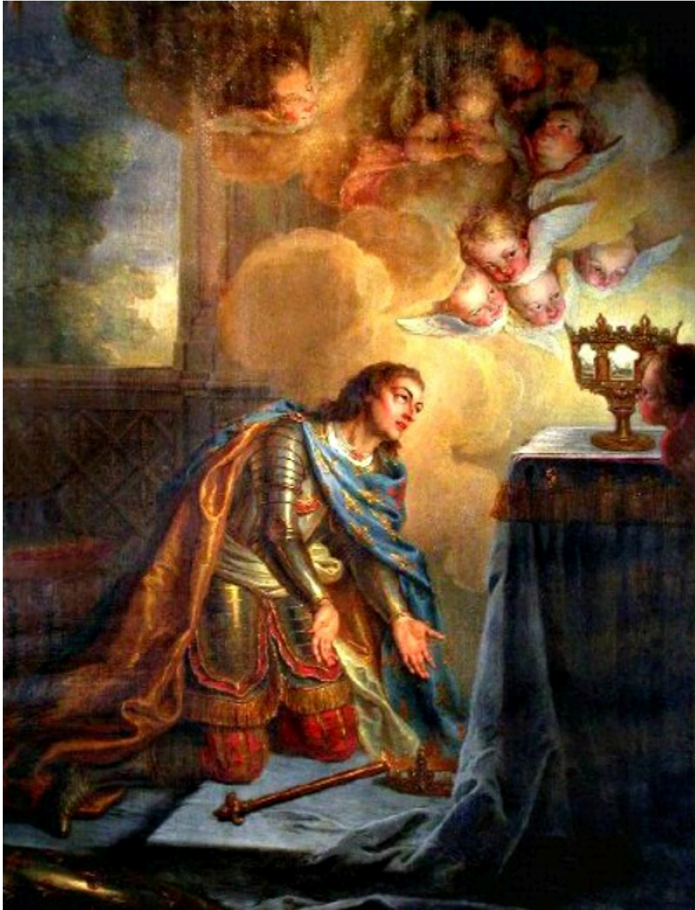
Painting of St. Louis IX, in the old Basilica of St. Louis the King, St. Louis, Missouri

Dominica XIV Post Pentecosten Fourteenth Sunday After Pentecost