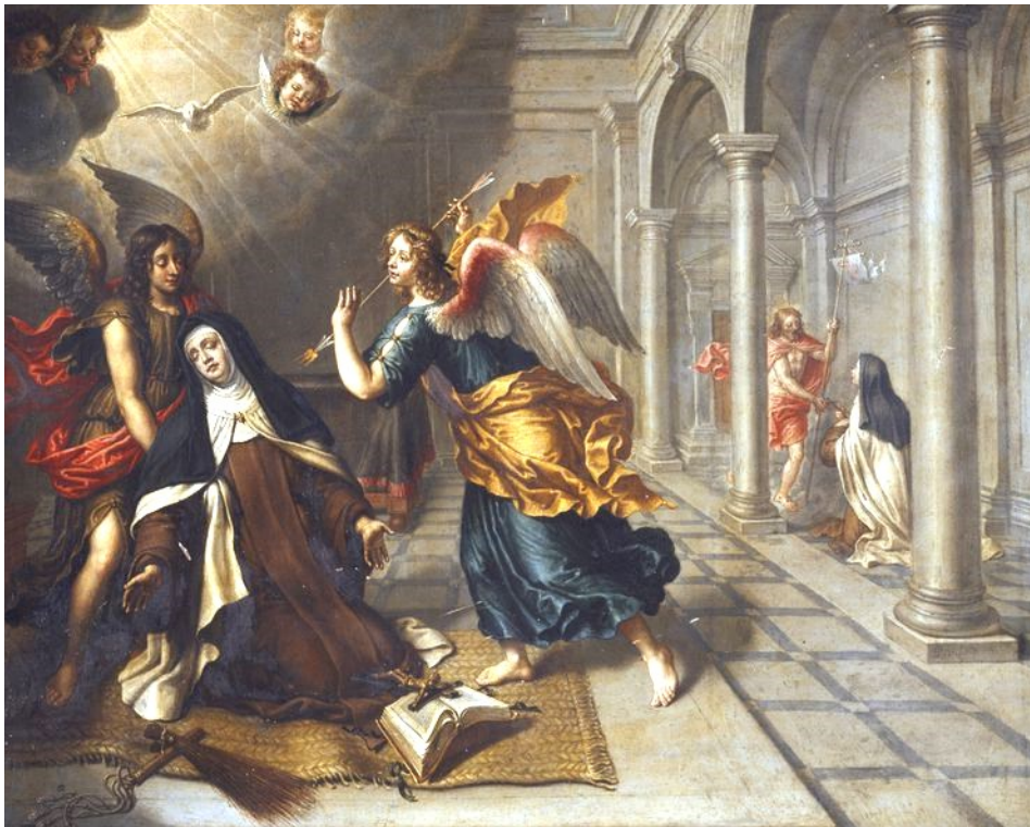
Transverberation of Saint Teresa of Avila

THE SUNDAY AFTER PENTECOST 28 TH SUNDAY IN ORDINARY TIME