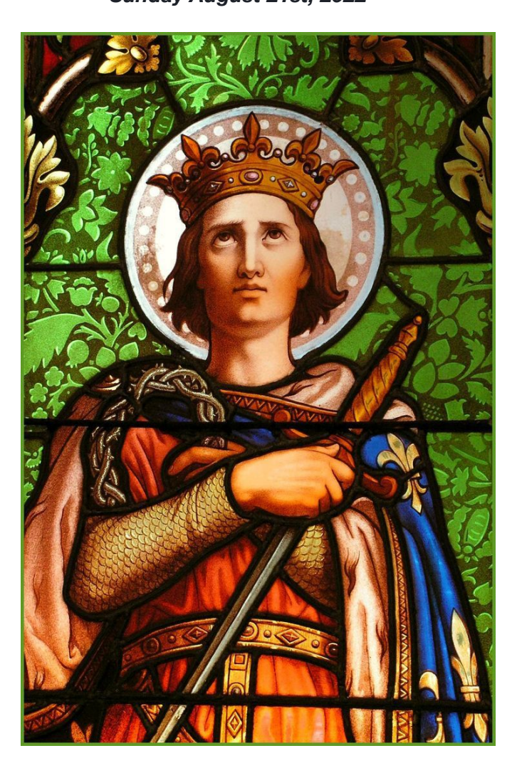
St. Louis IX, King and Confessor (+ AD 1270)

The 11th Sunday After Pentecost Dominica Undecima Post Pentecosten